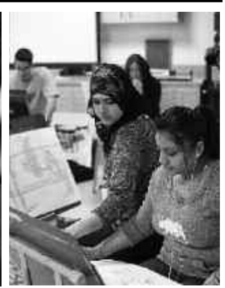
HCCC offers a number of special programs and instructional support services to enhance opportunities for academic success.

Although the main campus is conveniently located in Jersey City, a center in Union City offers residents of North Hudson County an opportunity to take courses in their neighborhood. Satellite centers in Bayonne, Hoboken, Kearny, and Secaucus make classes accessible in the southern and western parts of the county.